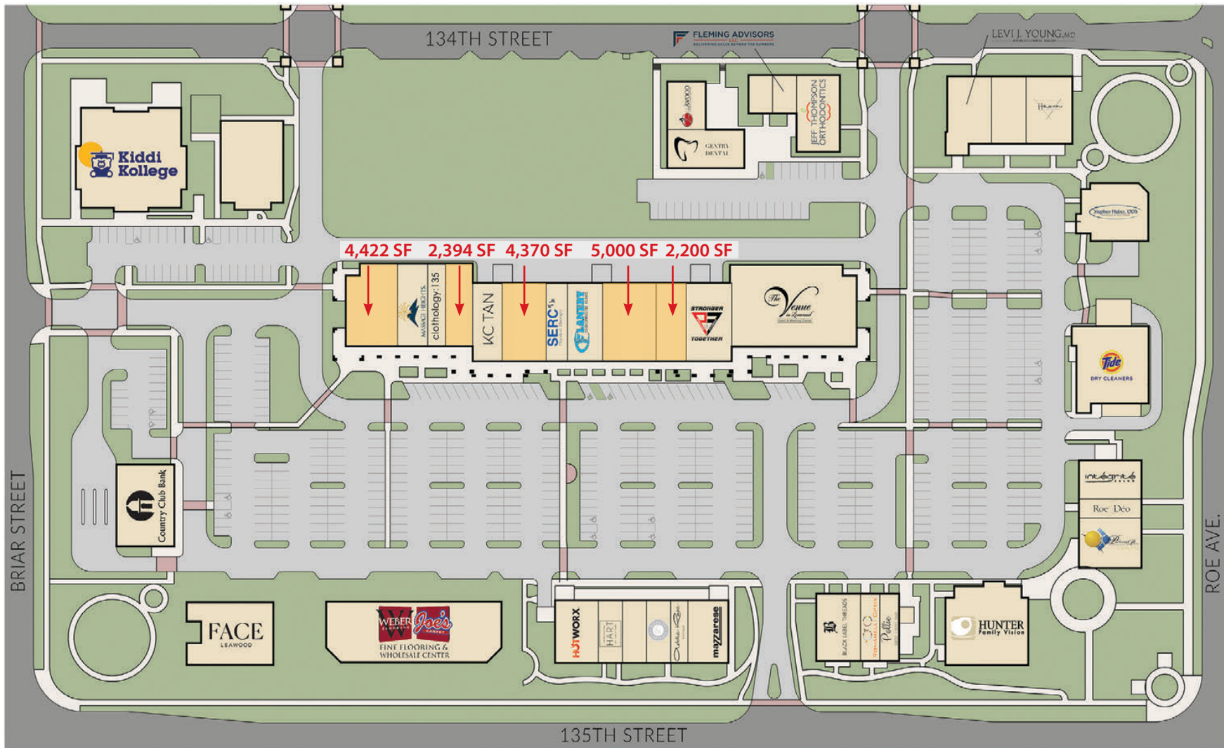
PARKWAY PLAZA, LEAWOOD, KS